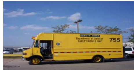
SAFETY MOBILE UNIT